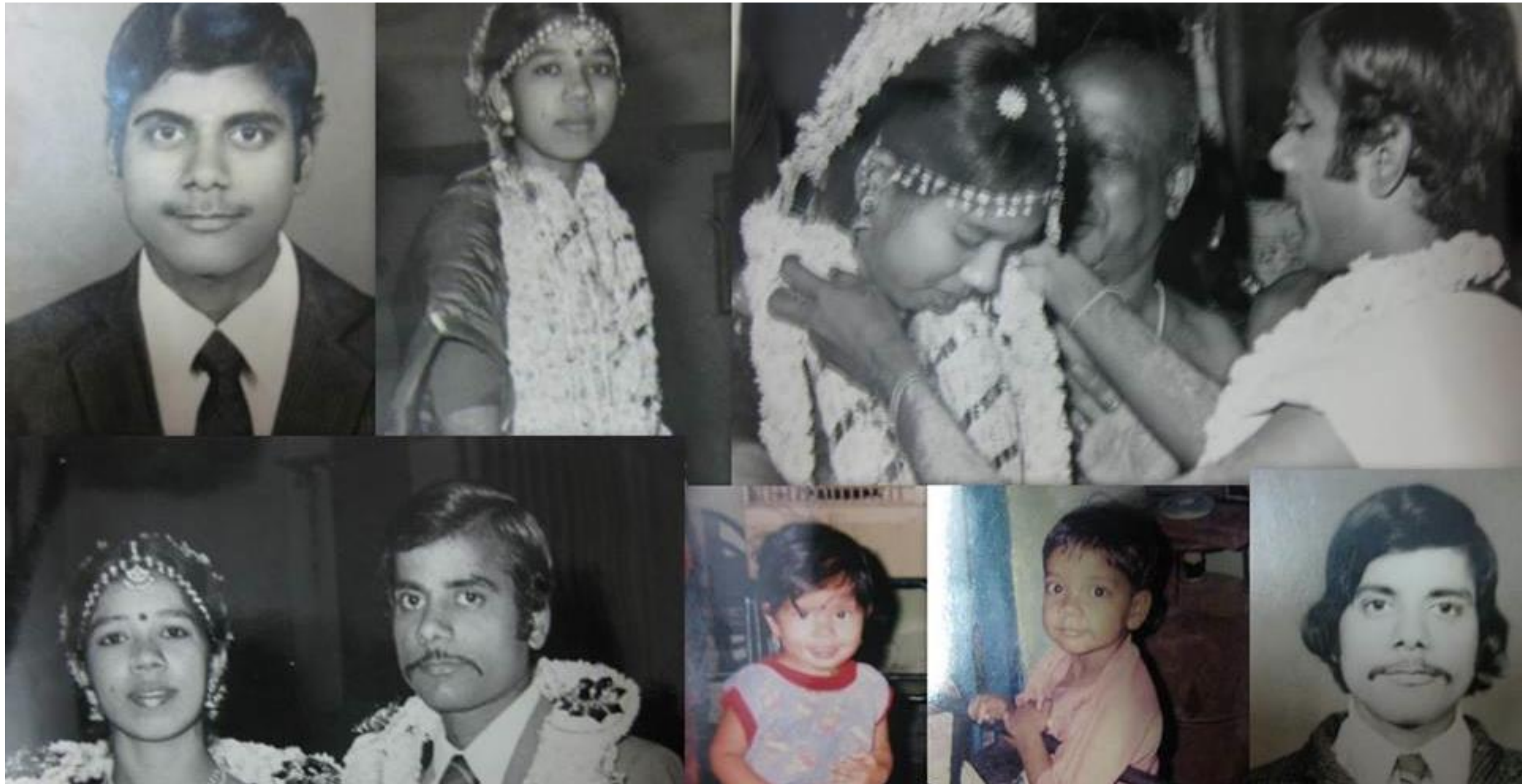
Year 1984, South India: One Couple Marry Happily move to Hyderabad. Hero begins working in Indian Railways. Heroine learns Telugu.